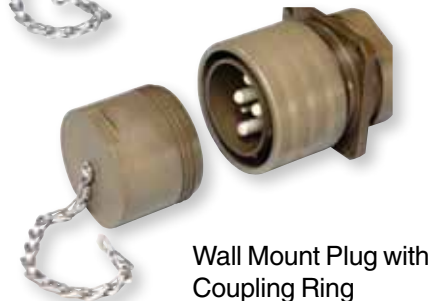
Wall Mount Plug with Coupling Ring (equipment end)

Contact Catalin Brandas for more information at cbrandas@amphenol-aao.com or call 607-563-5129