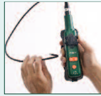
Articulating (6mm diameter) camera tip adjusts up to 320° viewing angle