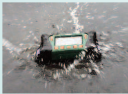
Drop proof and Waterproof housing meets IP67 standards