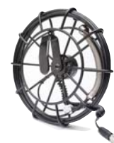
Camera probes with cable length greater than 3m will be coiled on a spool as shown on the left.