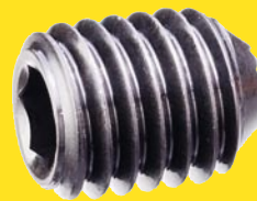
Internal Knurl Point