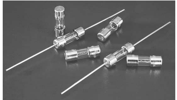
225 000 Series