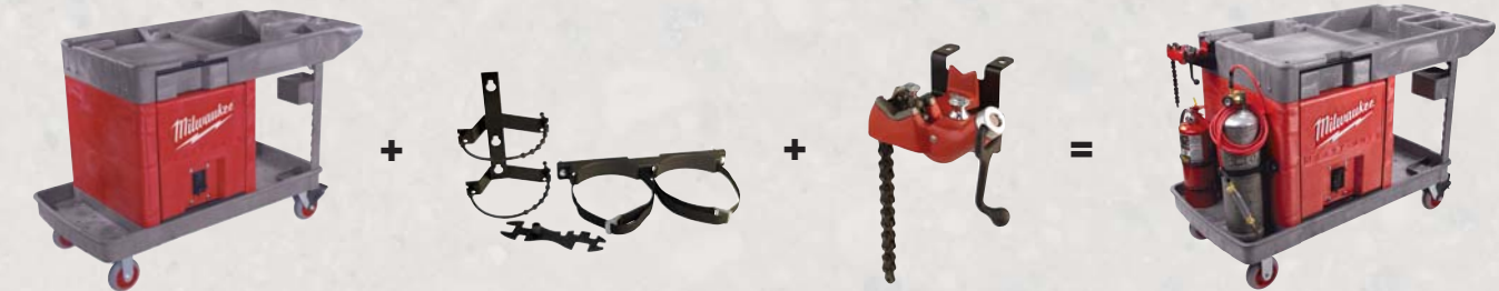
Trade Titan Cabinet Cart

The Heavy Duty Tank and Fire Extinguisher Mounting Kit allow up to (2) 'B' size Acetylene tanks and (1) 20 lb fire extinguisher to be securely mounted to the front of the cart. The Tank Kit Includes (2) heavy duty mounting brackets and (1) regulator wrench.