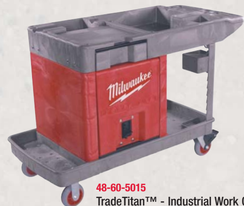
48-60-5015 TradeTitan™ - Industrial Work Cart with Locking Cabinet