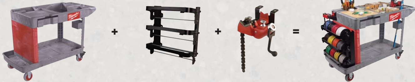
Trade Titan Open Cart

Everything an electrician needs to do their job is stored and organized on the Trade Titan™ cart. Tools, supplies and equipment are all easily accessible, mobile and secure. Three removable wire caddies and a heavy duty chain vise make daily tasks quick and easy.