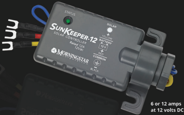
6 or 12 amps at 12 volts DC