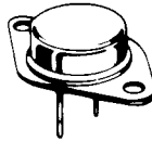
TO-204AA (TO-3) CASE 1-06